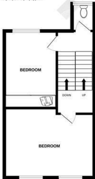
2ND FLOOR 384 sq.ft. (35.7 sq.m.) approx.