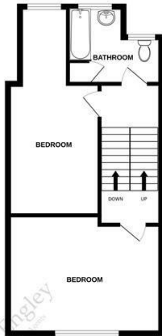
1ST FLOOR 461 sq.ft. (42.8 sq.m.) approx.